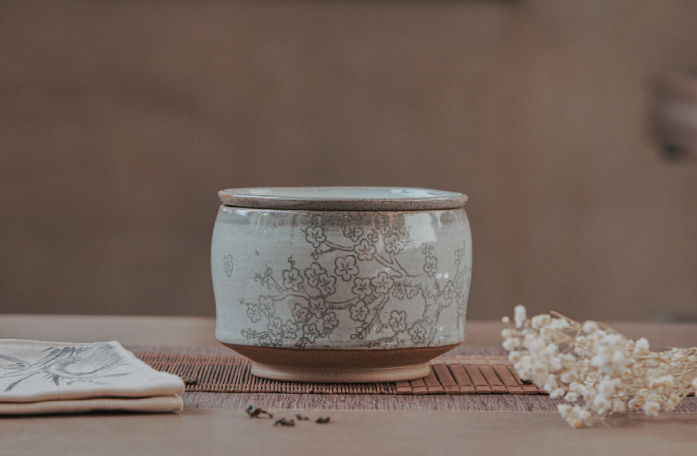
陶佐陶_青瓷鏤空刻花水方組 TAOZOTAO_Celadon hollowed-out Engraving Water Vessel