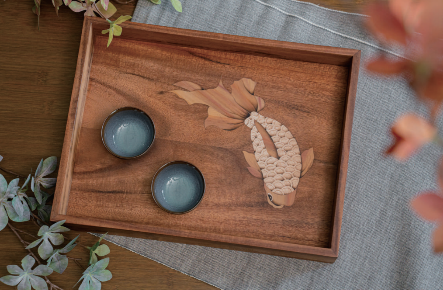
OakCherry_鑲花工藝托盤-金魚 OakCherry_Marquetry Tea Tray - GoldFish