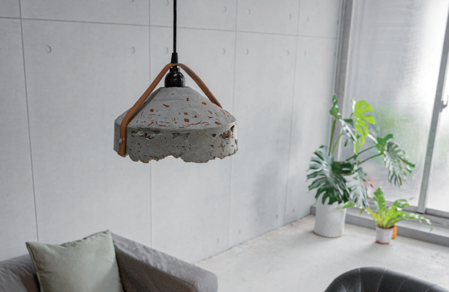
泥研植物社_重塑水泥吊燈 PULP_Concrete Pendant Light