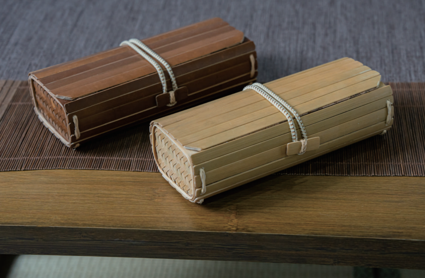
舒式_人字紋竹製文具盒 RELEISURELY_ Herringbone Pattern Bamboo Stationery Case