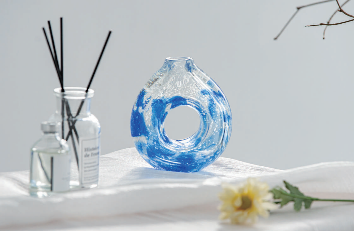
玲瓏窯_星海之環 Lin Long Yao_ Starry Sea Glass Vase