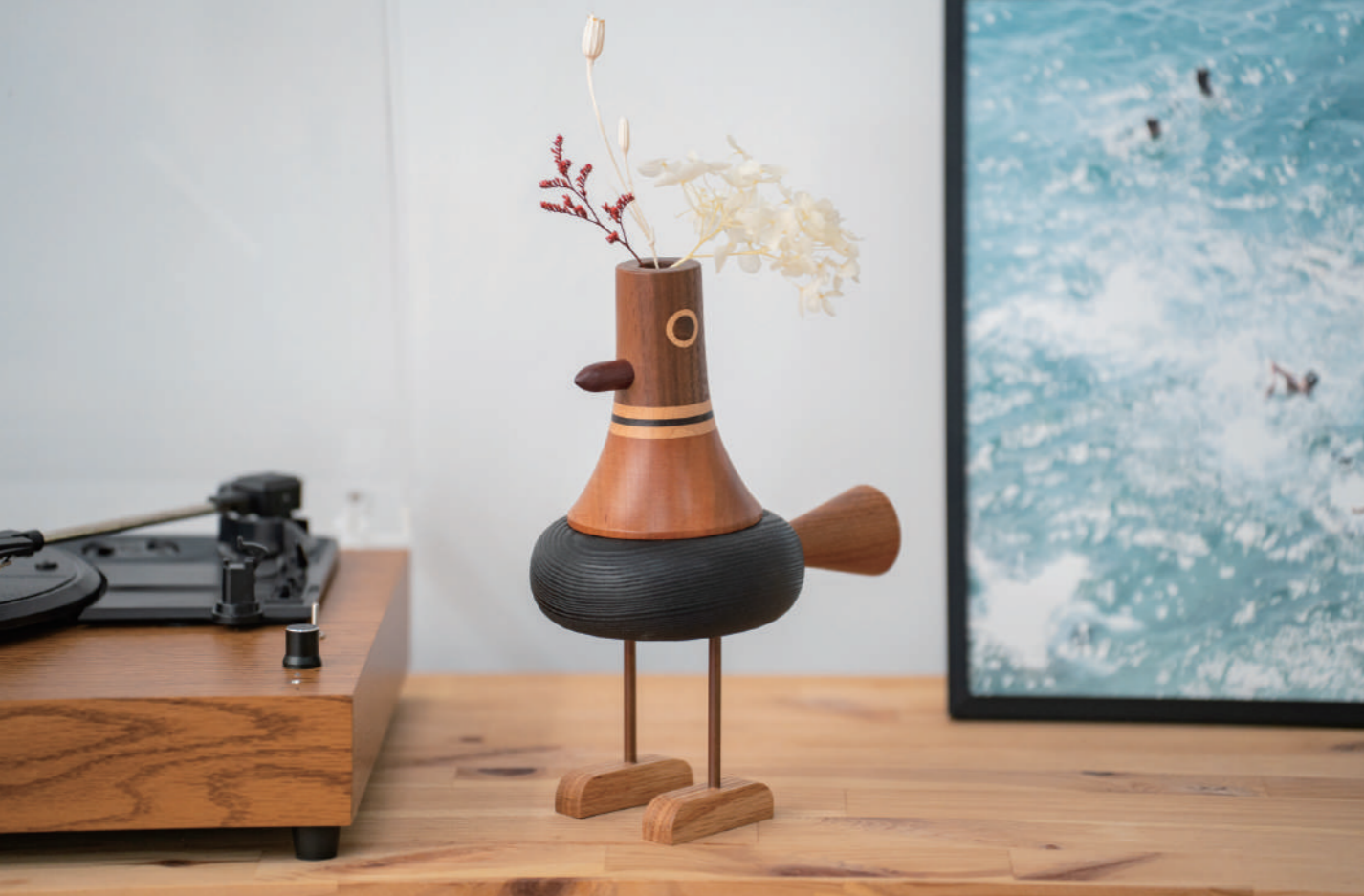
微一設計_花瓶鳥 OUI design_Bird Vase