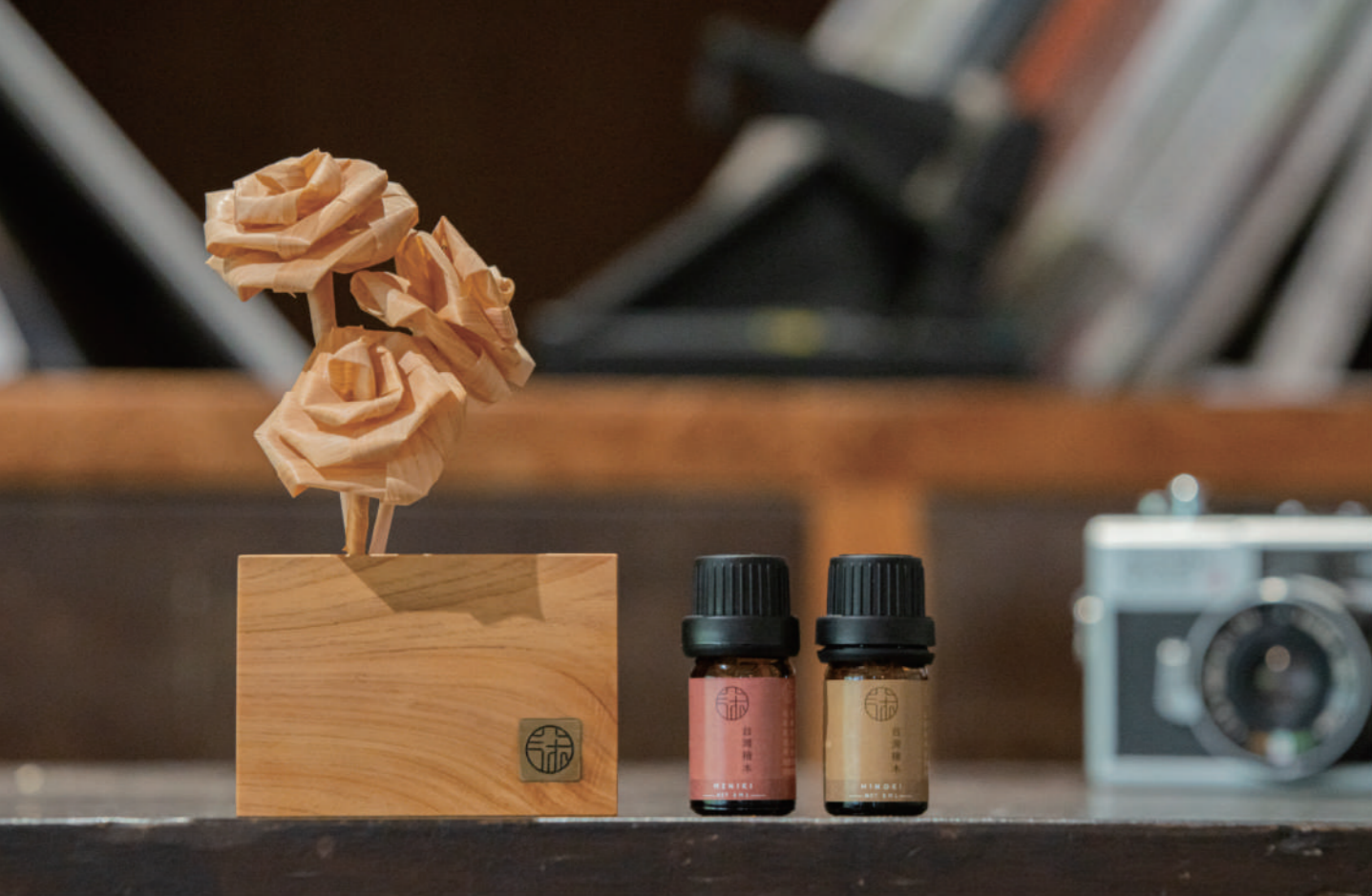
莠紋家具設計_臺灣檜木花 精油擴香禮盒組 Wood Grain Design_Taiwan Cypress Flower - Essential Oil Diffuser Gift Set