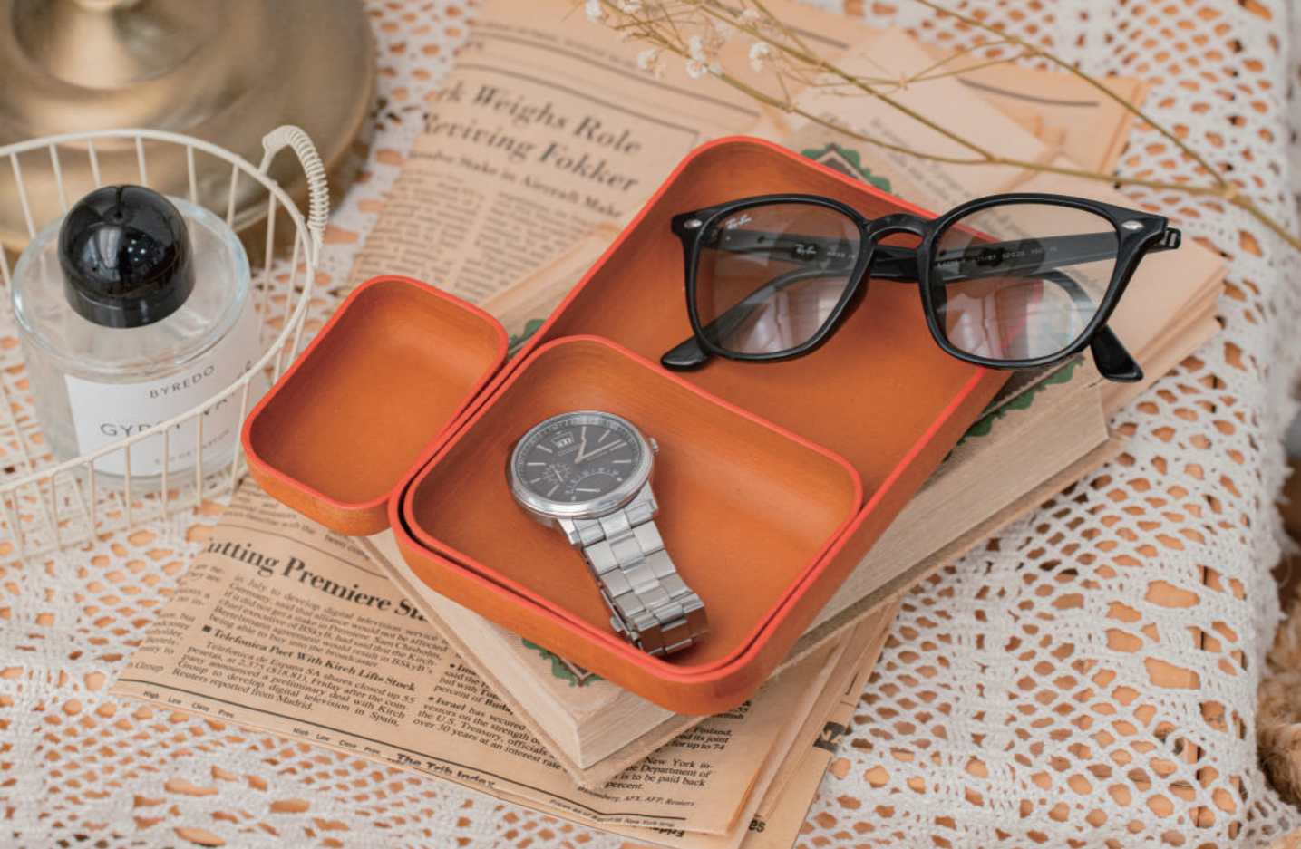
Hon Studio_吐司托盤 Hon Studio_Toast Shape Tray