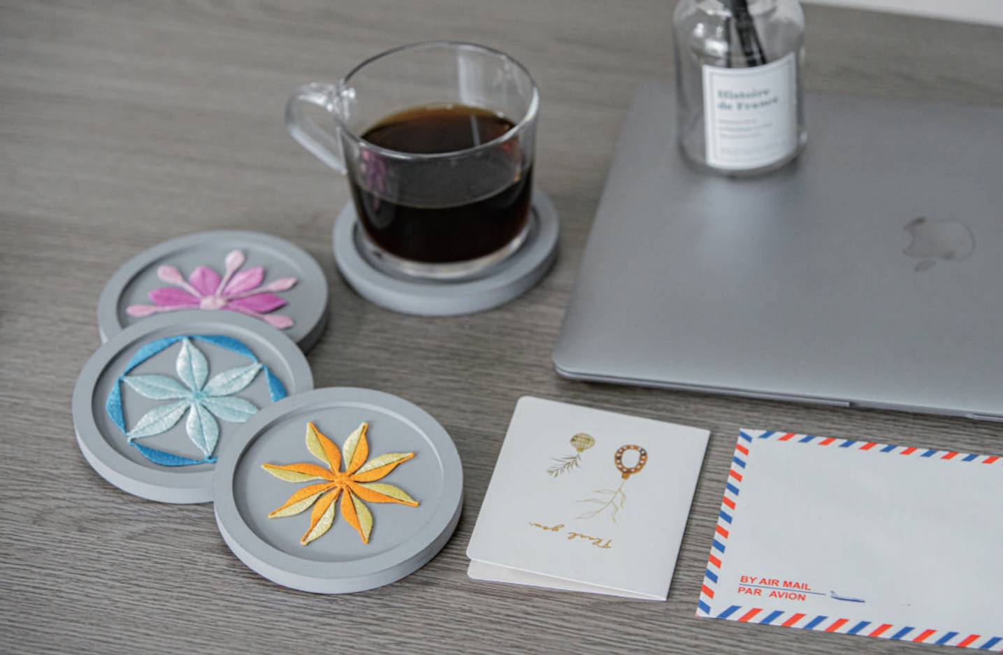
品花學_春花四喜杯墊 Hinka_Twined Flowers Coaster