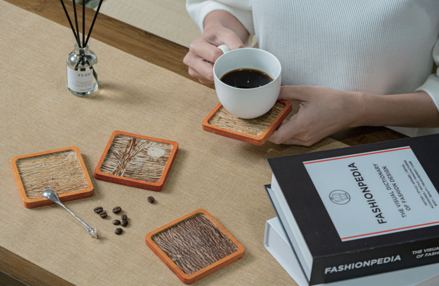
原纖本色_構樹樹皮杯墊 Original Fiber Primary Color_ Paper Mulberry Bark Coaster