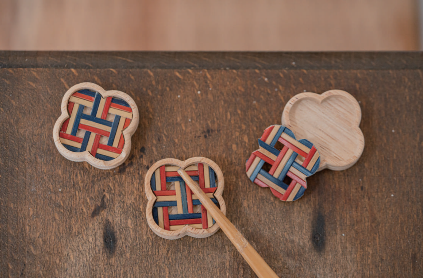
竹貓_海棠花 茶針置&筷架 Takeneko_Begonia Tea Pick & Chopstick Holder