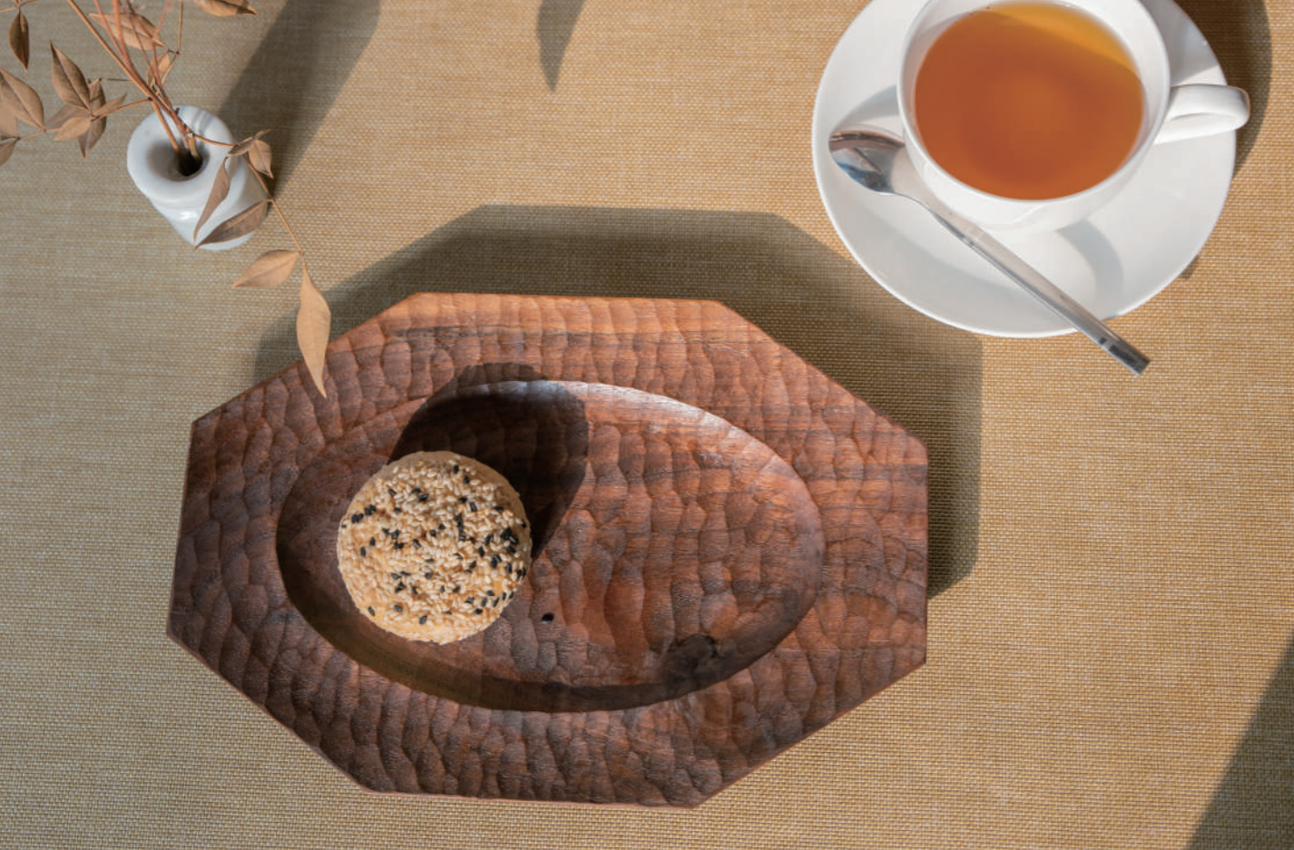
陳彫刻處_雙層橢圓角盤 CHEN'S WOOD_ Oval Wooden Plate