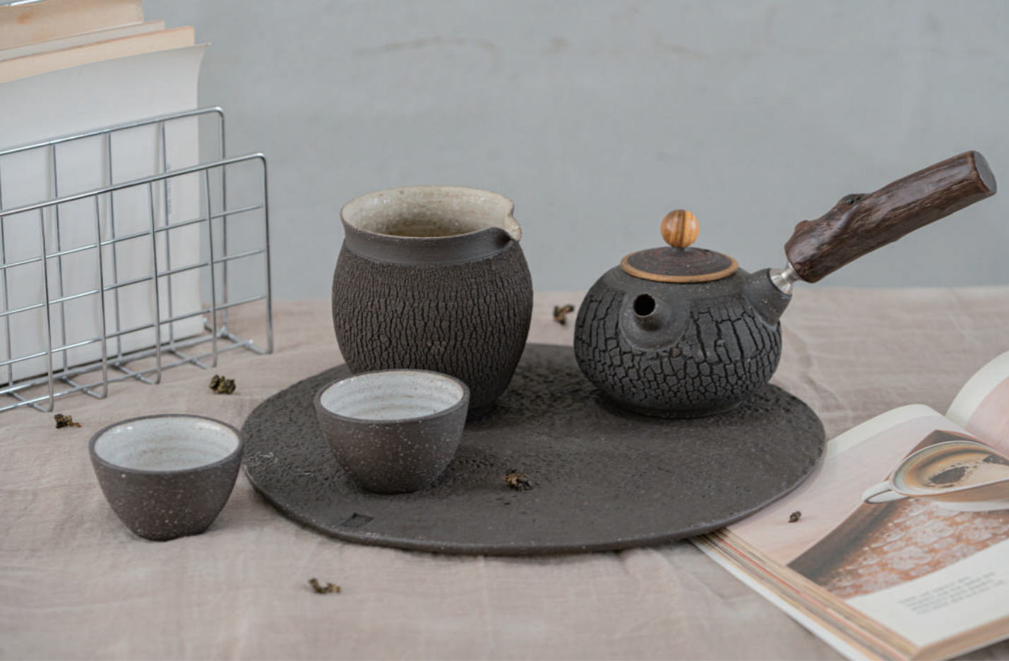
上作美器_無我系列-綠檀鈕承煙側把茶器組 SZMQ STUDIO_ Selfless Series - Green Sandalwood Teaware Set