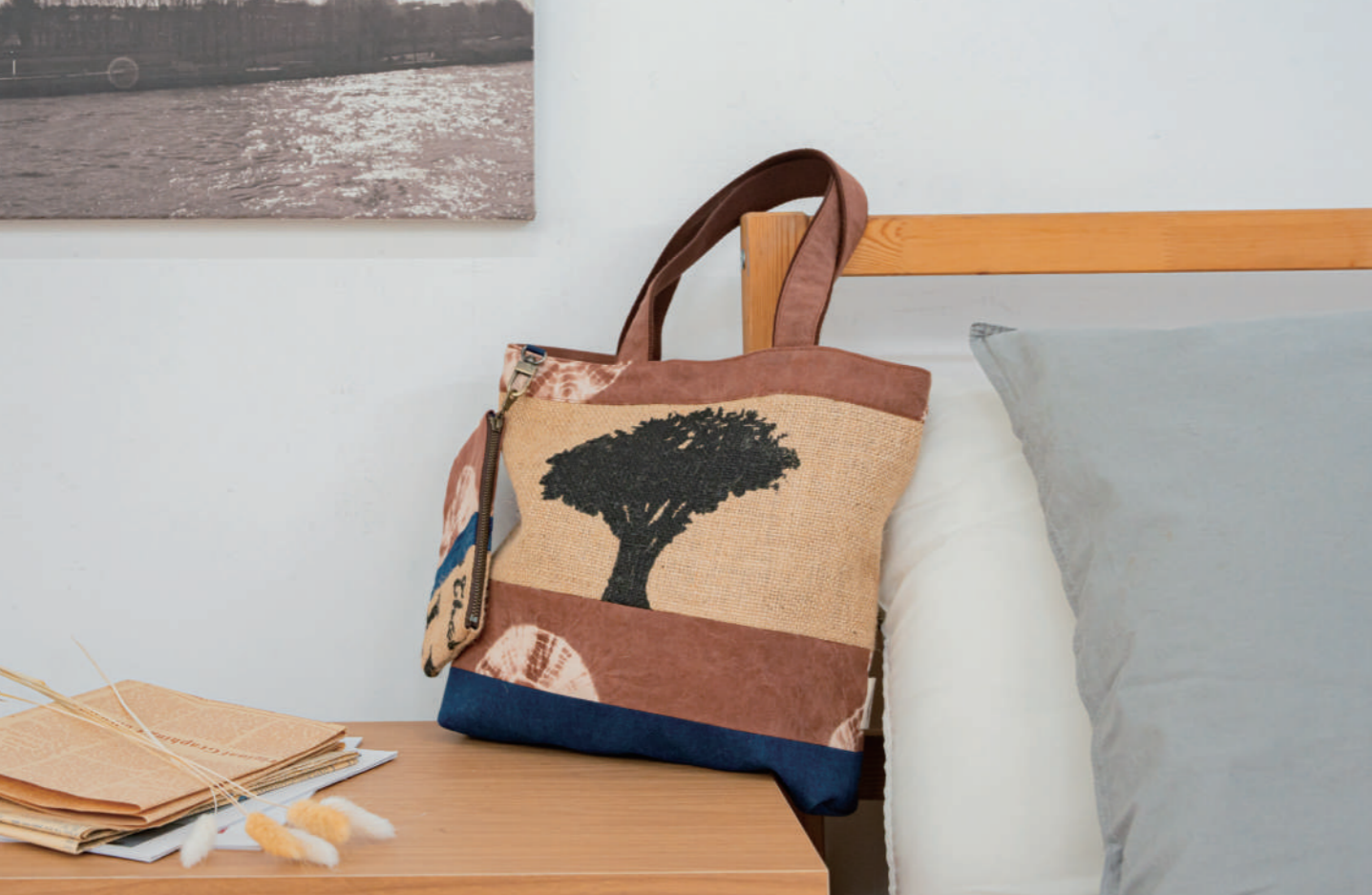
季節角落自然染_B&C多用休閒提包組 (Blue&Coffee) Seasons Corner_B&C Casual Totebag Set