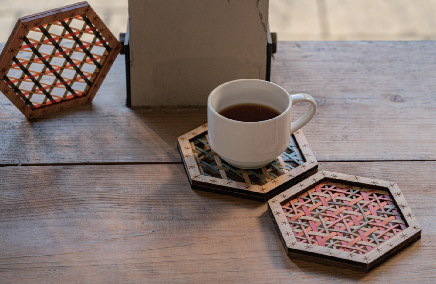
破竹工作室_窗花馬克杯墊-竹編文創商品 Po-Chu Bamboo Studio_ Bamboo Woven Coaster