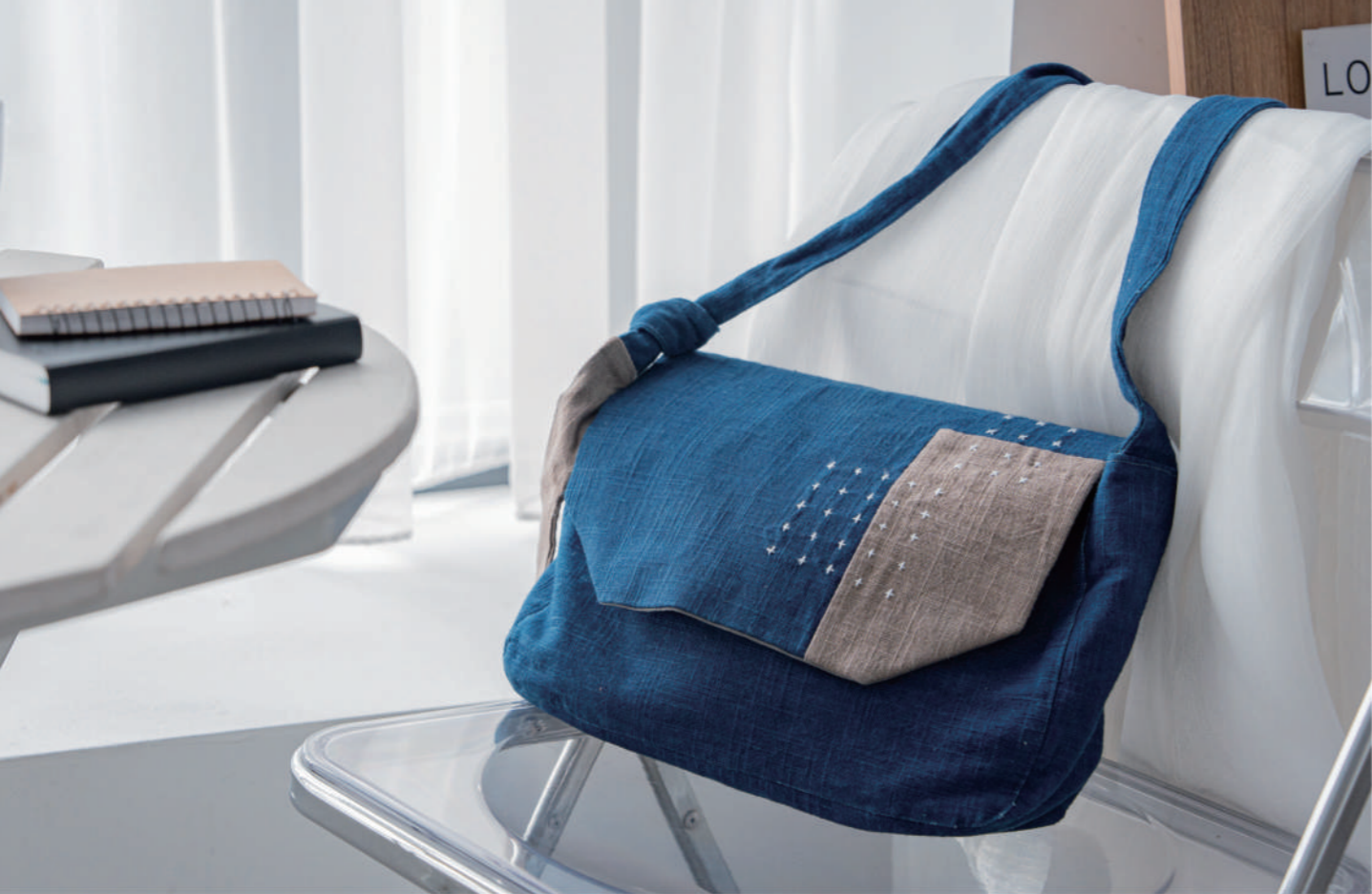
太平藍_藍染刺繡側背郵差包 Taiping Blue_Indigo Dyed Embroidered Messenger Bag